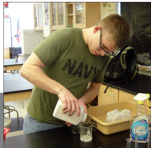
From Desktop to Countertop: Online learning isn’t just about sitting in front of the computer (though there’s a lot of that, too). Off-screen lessons—including self-guided science laboratories—are built right into virtual courses.